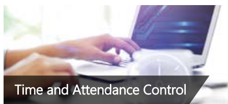
Time and Attendance Control